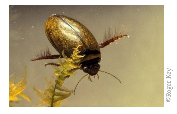
Water beetles particularly love areas of low growing grasses

The sections below identify some of the most important habitats in ponds and the ways they are used by pond wildlife. For more information see the introductory sections of management guides in this series.