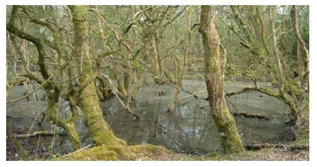
Dead trunks and branches in the water are a valuable habitat for animals like dragonflies, which like to lay their eggs into the soft rotting wood

The submerged plant species most commonly found in ponds reach a maximum diversity in quite shallow water, 20 - 60 cm deep. But specialised plant species, including some rare stoneworts, can sometimes be found in deeper ponds particularly where these sites have very clean clear water.