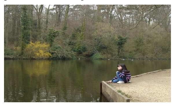
Bare open water is one of the poorest areas for wildlife – most animals need the structure of underwater plants to live amongst and shelter them from predators

Having said this, although deeper water (i.e. water more than 30 - 50 cm deep) is not vital in a pond, it can be valuable for some species. Diving ducks, for example, find much of their food in water more than one m deep. Bats often prefer to drink and hunt over open water that is clear of surface vegetation. Where dense stands of submerged plants are present some aquatic insects can thrive even in the presence of predacious fish in this deeper zone.