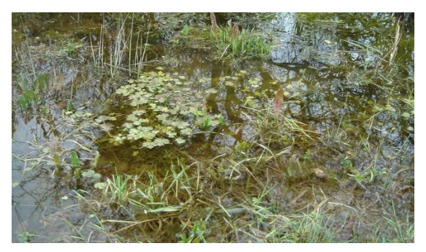
Shallow underwater plant mosaics create an underwater architecture which is an excellent habitat for many pond animals

Pond edge areas which have underwater complexes of wetland herbs and grasses are usually the most diverse areas in any pond. Other structures can serve a similar purpose, including dense stands of submerged plants in open water areas, the underwater root mats that grow out from willows and even the spaces between coarse leaf-litter or gravel at the bottom of a pond.