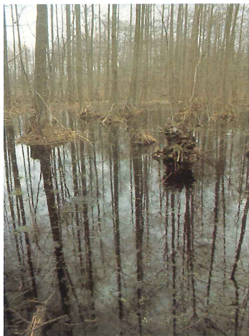
FIG. 1. (a) ( left ): A terraced temporary pond in alder woodland of Bialowieza Forest, Poland. (b) ( below ): The effect of draining temporary pools. This stream at the edge of Bialowieza Forest has been created by draining the temporary ponds which would otherwise fill the valley.