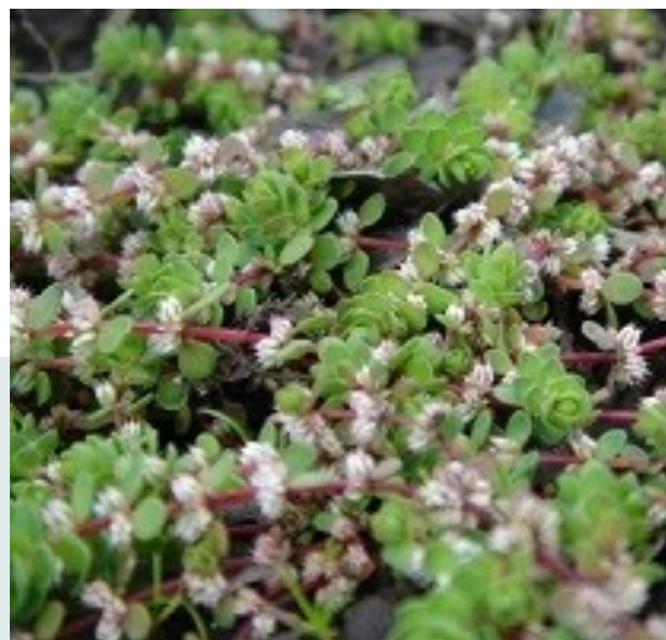
Coral Necklace. Can you help survey for this rare wetland plant.

Use your plant survey skills to help us find rare plants such as Pillwort, Coral Necklace and Pennyroyal. First learn how to identify rare wetland plants and then spread out to visit other ponds to undertake your own surveys. At the end of the day coming back together, to collectively share the findings.