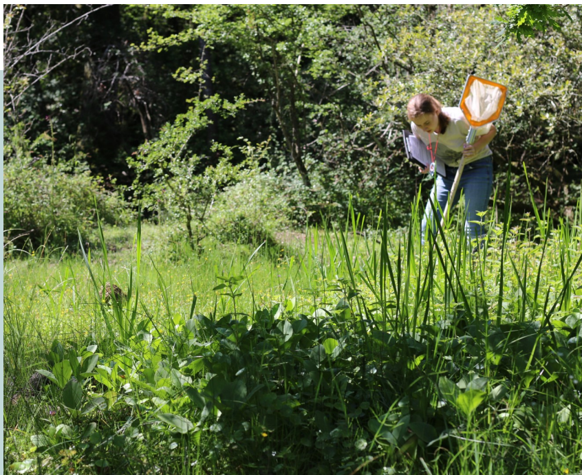
Volunteer surveying for Pond Mud Snail, a rare wetland snail. Once widespread, this snail is now restricted to just a few ponds across the country, many of which in the New Forest.

Learn how to identify this rare wetland snail, then head out and undertake surveys at some of the last remaining ponds known to be home to Pond Mud Snail. The New Forest is one of the remaining strongholds for this snail. In 2014 ten new sites were found. Come along and let's see if we can find anymore.