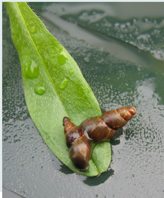
The New Forest is one of the last remaining strongholds for Pond Mud Snail

Join a two hour circuit walk around some very special local ponds to Brockenhurst. Help to gather information about the ponds and streams in the area using quick and simple test kits to measure water pollution. Bring lunch for a picnic on the way or make use of the shortcuts back to Brockenhurst for a shorter walk, and a quicker route to a pub lunch.