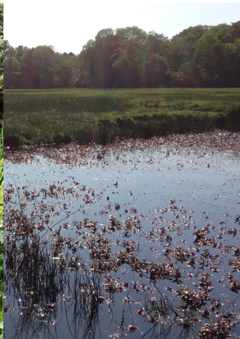
Queen's Meadow: Do you think this is a clean water gem? Why not join a Water Blitz to find out how clean the Forest's ponds are.