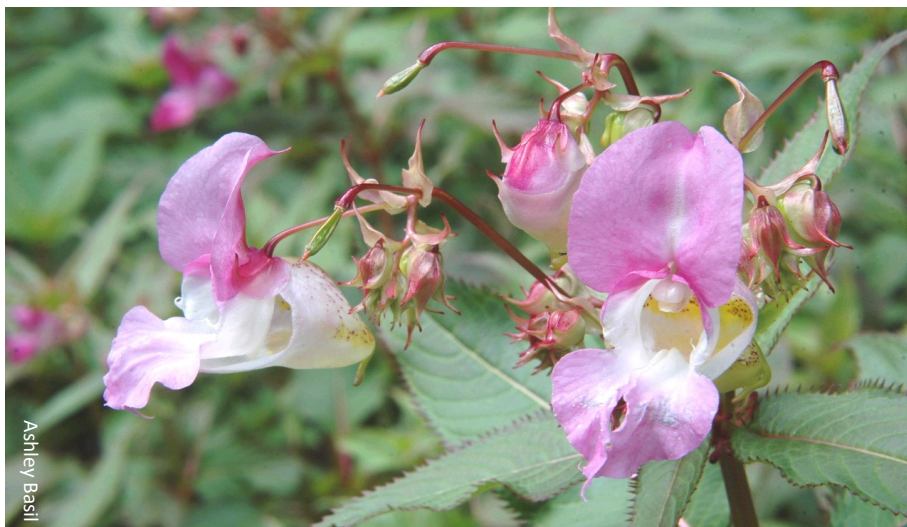
Himalayan Balsam on the Lymington River