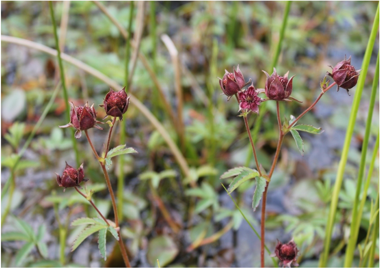
Above: Marsh Cinquefoil