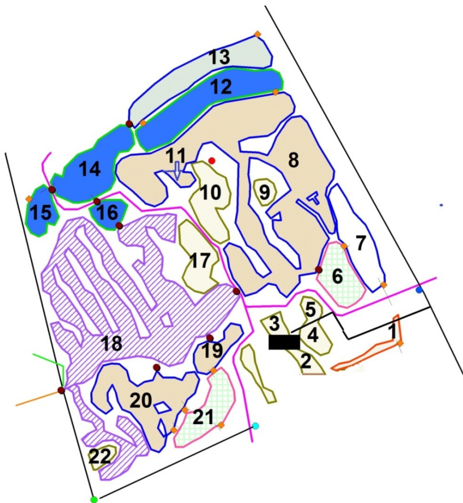
Figure 1: Map showing numbering of the Wetlands ponds

The data for each of the 22 ponds assessed using PSYM are summarised in Appendix 1.