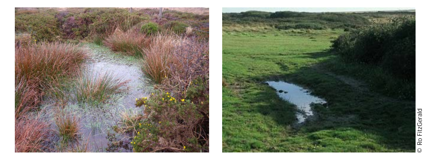
Figure 3. Ideal habitat for Three-lobed Water-crowfoot – the pond on the left is a small, shallow temporary pool; the pond on the right is a pool which has formed in the ruts of a trackway.