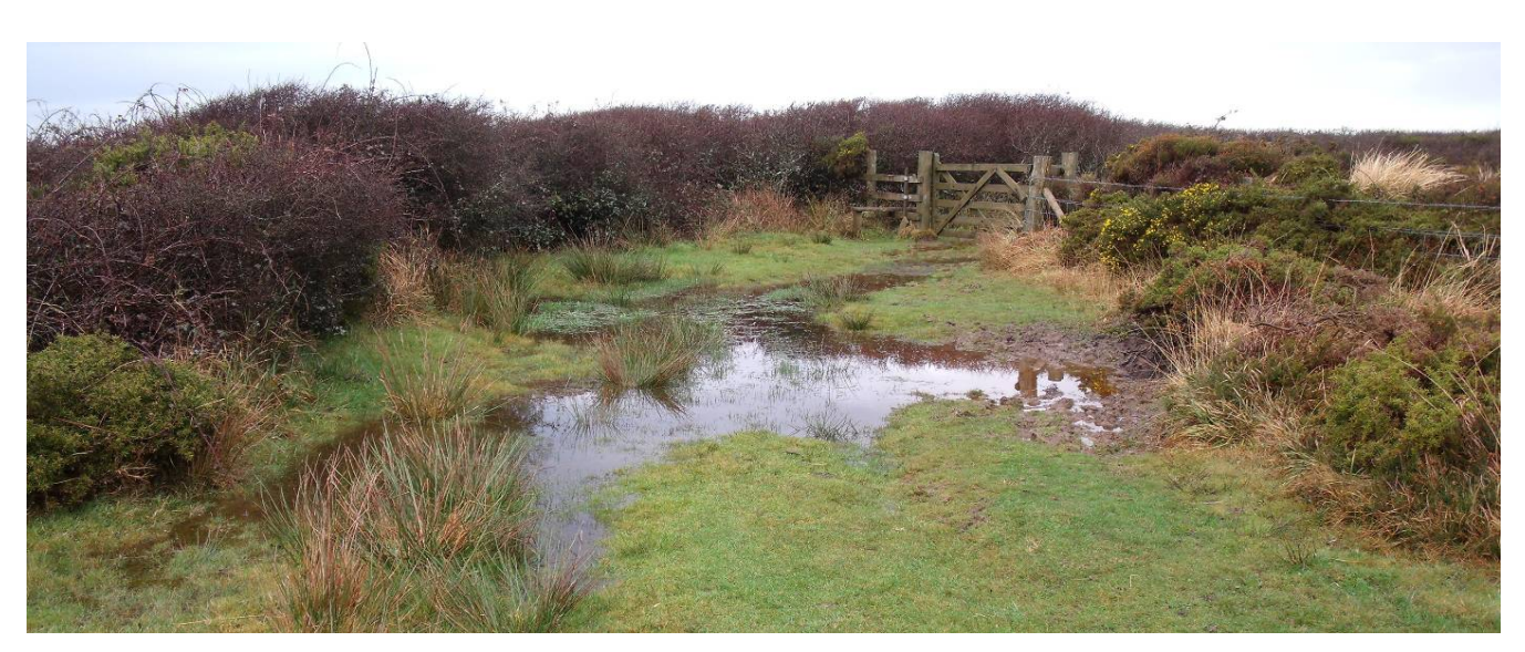
Figure 5. Heavy winter poaching adjacent to this gateway – a pinch point for animal and vehicle traffic - has created a seasonal pond, providing ideal habitat for Three-lobed Water-crowfoot on the Lizard in Cornwall.