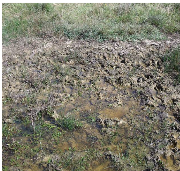
Figure 4. Grazing of trackways adjacent to Ruan pool has led to the creation of heavily poached temporary pools for Pigmy rush.

Grazing with Dexter cattle has been restored to Predannack Airfield (MOD) and plans are in progress to graze Kynance and the Lizard Downs (National Trust) for Pigmy Rush and other rare annuals.