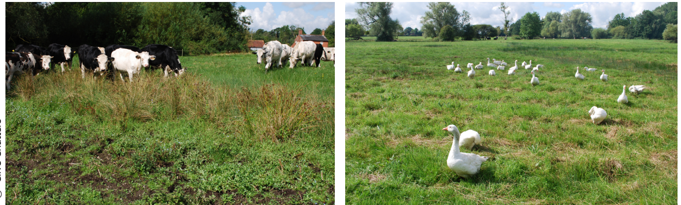
Figure 6. Heavy grazing creates the bare poached ground needed by Brown Galingale. At this site the geese create additional disturbance on top of the rough trampling cause by the cattle.

The decline of Brown Galingale has resulted from changes in traditional farming practices. Any decline or cessation of grazing will lead to encroachment by vegetation, reducing the availability of open space and mircosites that this species requires. Ideally, Brown Galingale needs periods of intense grazing to create open conditions (Figure 6), interspersed with periods of rest to allow the plants to develop. To promote this, heavy grazing should be avoided from June to October.