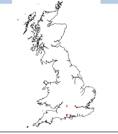
Data provided by the BSBI