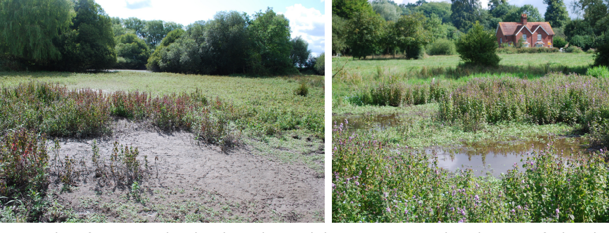
Figure 3. Habitat for Brown Galingale - this sedge needs heavy grazing to reduce the cover of other plants and a broad drawdown zone. These winter flooded temporary ponds are heavily poached and have over 75% bare ground when the pond dries down at the end of spring.