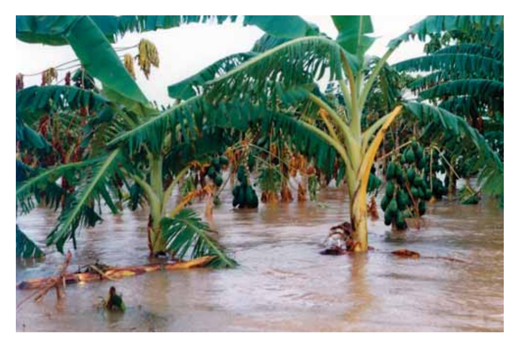
Flooding in Tonle Sap area of Cambodia inundates agricultural lands

Effective watershed and forest management consistently yield significant environmental services, including high-quality freshwater supplies. However, the influence of watershed and forest management practices on stream-flow patterns is relatively small, and is mainly limited to watersheds up to 500 km<sup>2</sup> in area. As such, forests alone will not be able to protect entire river basins from catastrophic events. Even with the best intentions, no amount of watershed management interventions will prevent major flooding events, although there are some definite benefits at the local scale.