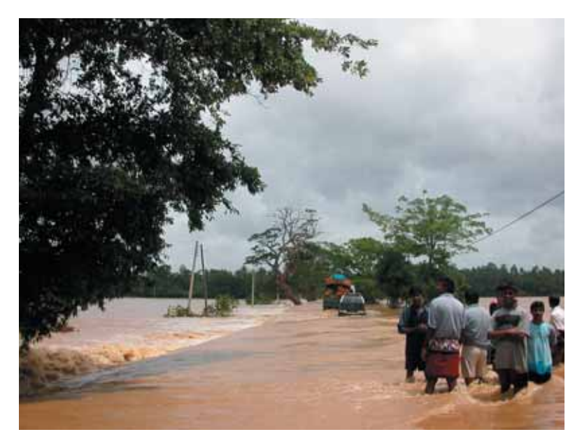
Floods after heavy rain in May 2003, Ranna, Hambantota District, Sri Lanka

Incentives need to be offered to encourage desired land uses and land-management practices and to align private interests with the public good. Compensation needs to be provided to land users negatively affected by the plans. The results of the implementation are monitored and impacts of various policy instruments and interventions assessed, to ensure that the objectives are being achieved and that costs and benefits are equitably shared. The entire process is evaluated on a regular basis and, if necessary, objectives or activities can be adjusted to meet new requirements or expectations. Management objectives can change over time as priorities and land-use practices evolve. This is a dynamic process that ensures, through the various feedback mechanisms, that objectives remain realistic and can be reached without causing unacceptable and unmanageable environmental and socio-economic impacts.