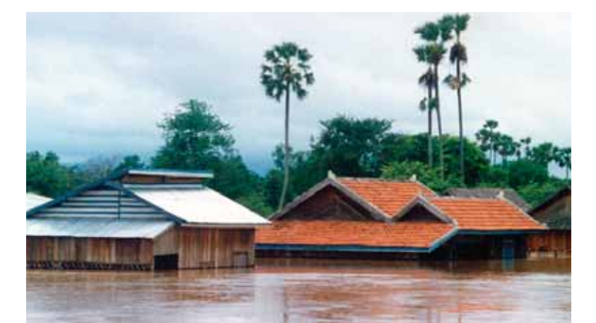
Recent flood in Cambodia

As a first step, decision-making needs to be supported by an objective perspective of the relationships between forests and water, in order to distinguish myths and conventional wisdom from facts and sound science. Building on better understanding of physical processes and the relationships between land use and hydrology, more effective responses can be designed to reduce the magnitude of disasters without repeating the mistakes of the past.