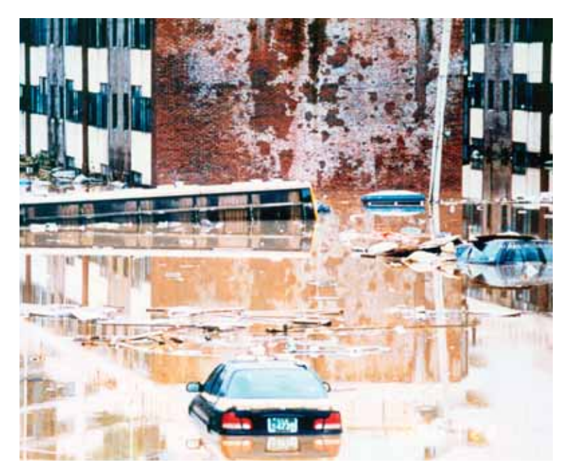
For intensively developed urban areas and floodplains, land-use planning and control measures have an important role to play in flood mitigation (Moosan City, Kyungkido Province, Republic of Korea)

The media also plays a significant role in shaping perceptions of the intensity, frequency and severity of flooding. Modern television news networks, in particular, can record and broadcast news of catastrophes far more quickly and comprehensively than anytime in history. While major flooding events of the past often went completely unreported, or were described only sketchily, perhaps months after their occurrence, modern media has the capacity to report extensively on flood disasters occurring anywhere in the world within hours. This capacity of the media, coupled with journalists' penchant for sensationalising news events — particularly disasters — can easily lead people to conclude that floods are occurring more frequently and with greater severity than in the past. Scientific evidence, however, does not support such conclusions.