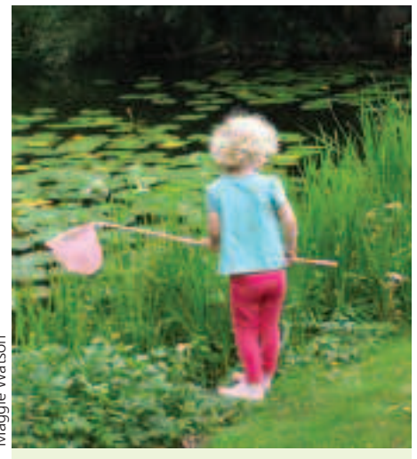
The Million Ponds Project aims to bring lasting change to the landscape so that we can all enjoy beautiful clean water ponds and their wildlife.

'Ponds are important habitats for a wide diversity of wildlife and can provide 'stepping stones' for many species that use freshwater habitats to move across the landscape'