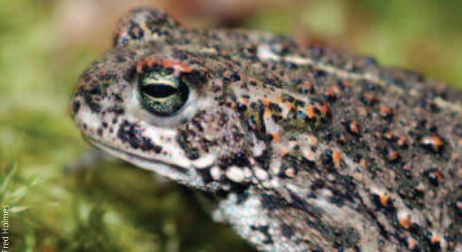
Woolmer Forest (Hampshire). Amphibian and Reptile Conservation have created shallow ponds on Defence Estates land that will benefit both the Spangled Water Beetle – Woolmer is the only place where this species occurs in the UK – and the rare Natterjack Toad.