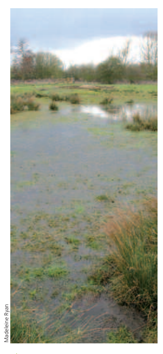
Minerals sites often provide great opportunities for clean water pond creation.

These wonderfully rich shallow pools in Oxfordshire were created with the Lower Windrush Valley Project and Smiths of Bletchington on land owned by Witney Town Council.