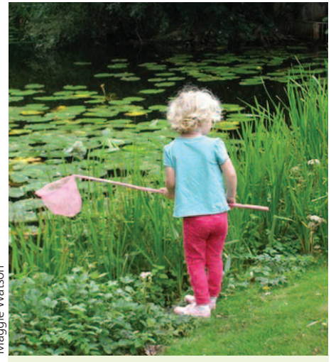
The Million Ponds Project aims to bring lasting change to the landscape so that we can all enjoy beautiful clean water ponds and their wildlife.

'Ponds are important habitats for a wide diversity of wildlife and can provide 'stepping stones' for many species that use freshwater habitats to move across the landscape'