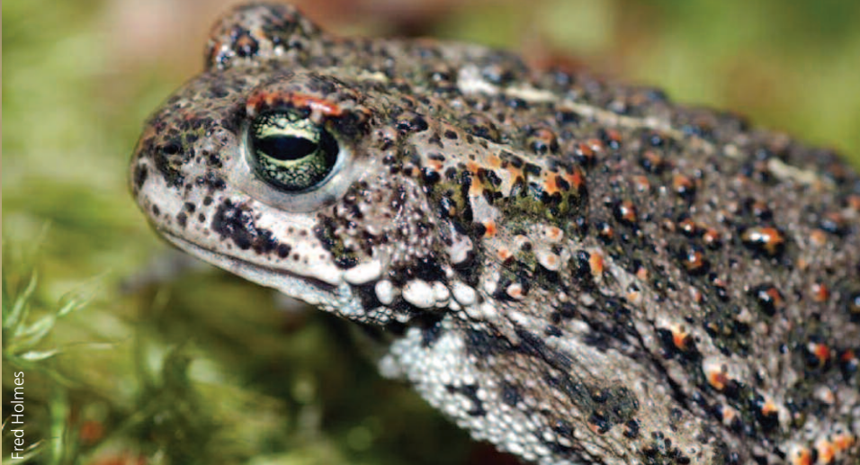
Woolmer Forest (Hampshire). Amphibian and Reptile Conservation have created shallow ponds on Defence Estates land that will benefit both the Spangled Water Beetle – Woolmer is the only place where this species occurs in the UK – and the rare Natterjack Toad.