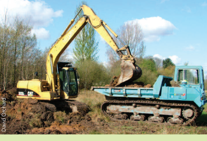
Abney Hall (Greater Manchester).

clean water ponds, complements the larger waterbodies already present in the area.