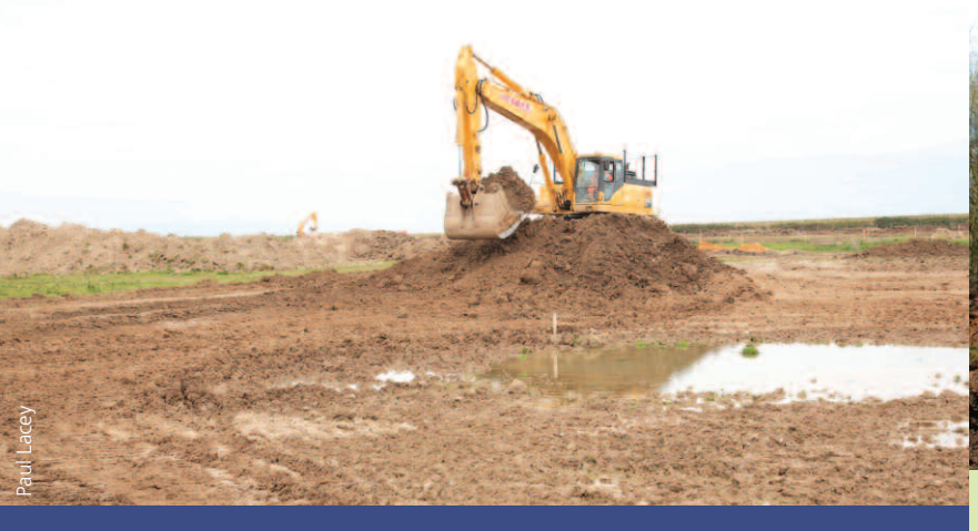
Rye Harbour Nature Reserve (East Sussex). The Environment Agency's complex of around 50 new

clean water ponds, complements the larger waterbodies already present in the area.